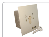
Key Switch Flush Mount #14.237.000