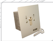
Key Switch Flush Mount #14.237.000