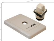
Toggle Switch #14.201.401 Toggle Plate #14.220.401