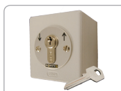
Key Switch Surface Mount #14.235.000