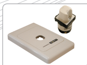
Toggle Switch #14.201.401 Toggle Plate #14.220.401