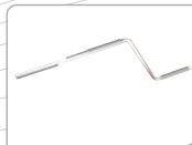
Invisible Carden #14.300.000 with Crank Handle #14.301.000