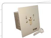
Key Switch Flush Mount #14.237.000