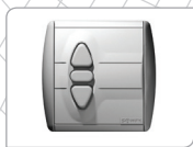
Inis Uno Wall Switch #14.202.401