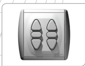
Inis Duo Wall Switch #14.203.401