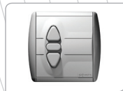
Inis Uno Wall Switch #14.202.401