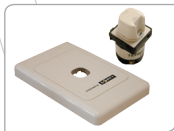
Toggle Switch #14.201.401 Toggle Plate #14.220.401