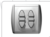
Inis Duo Wall Switch #14.203.401