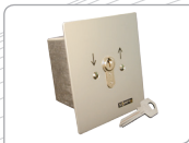
Key Switch Flush Mount #14.237.000