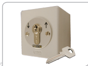
Key Switch Surface Mount #14.235.000