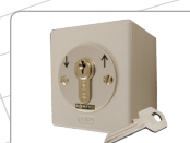
Key Switch Surface Mount #14.235.000