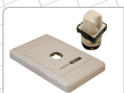
Toggle Switch #14.201.401 Toggle Plate #14.220.401