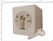
Key Switch Surface Mount #14.235.000