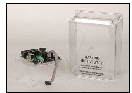
EB1 kit shown complete