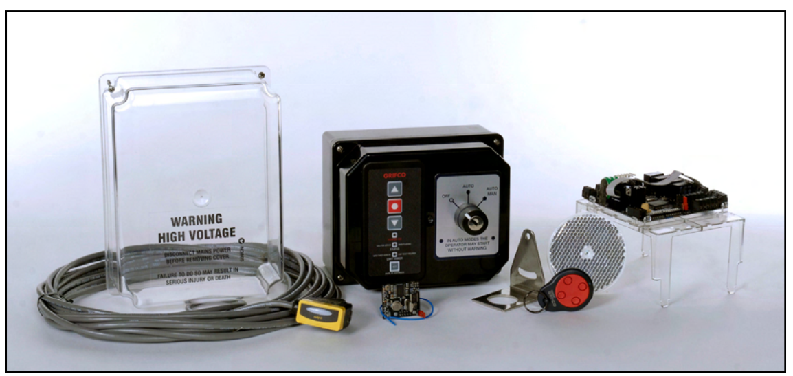
* Elite Kit pictured