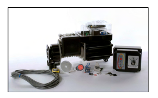
Elite kit shown fitted to Maestro Operator