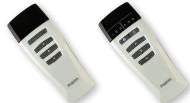
1 Channel Transmitter 6 Channel Transmitter

The PowerSmart™ system incorporates a built-in radio receiver that is compatible with the CW Maxim Radio Transmitter and is available in both 1 Channel and 6 Channel options. Both transmitters are powered by a 3 Volt Lithium button battery.